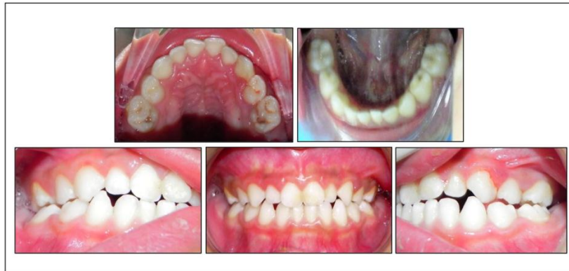
Fig. (2). Pre-operative photographs.

Radiographic examination was taken following the American Academy of Pediatric Dentistry guidelines [17]. It showed proximal caries on multiple upper and lower posterior teeth including #55, 63, 64, 65, 74, 75, 84, and 85. While some caries lesions were confined to the enamel surfaces, others extended deeper to involve the dentine. However, in all teeth, no periapical pathology was noticed. Based on his medical history, clinical findings, diet, and oral hygiene, the patient was considered high caries risk according to the Caries-risk Assessment Tool (CAT) [17].