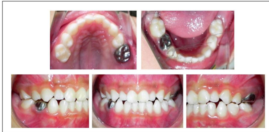
Fig. (3). Post-operative photographs.