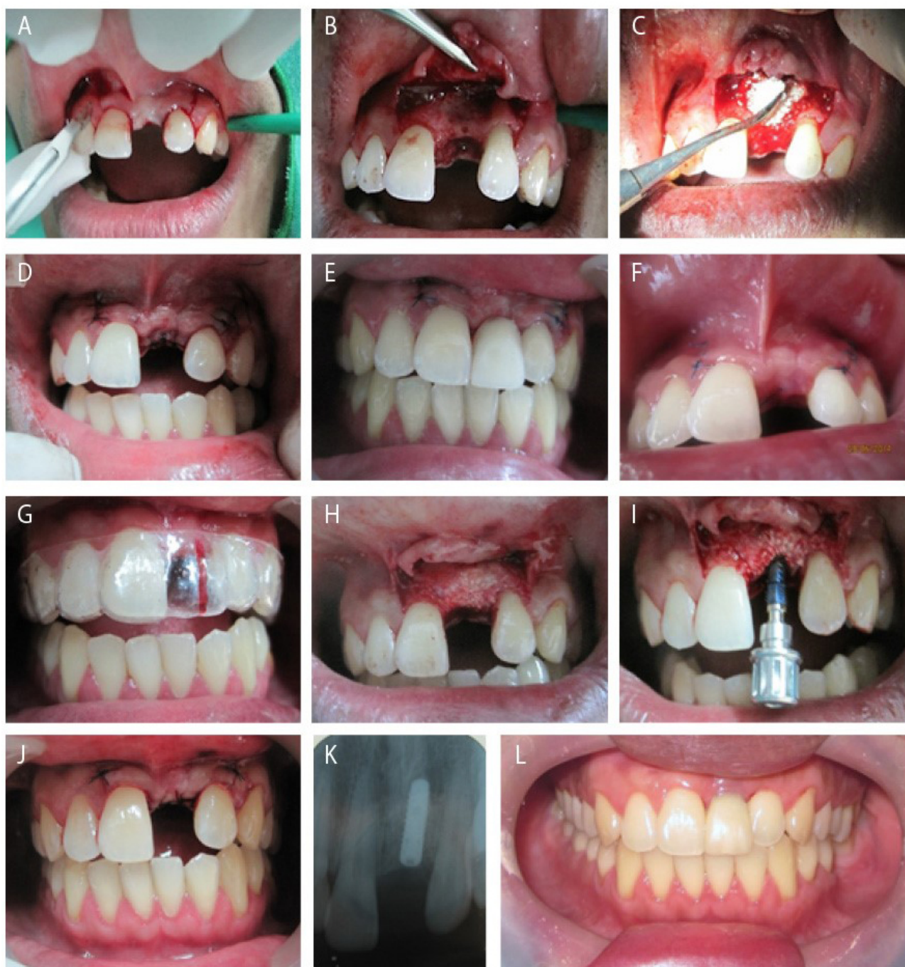
Fig. (2). A Vertical incisions were made on the 2/3 of mesial angle of adjacent teeth. B Full thickness flap was elevated. Bone decortication was made using a slow-rotating small diameter bur. C Bone graft was applied. D Nylon 5.0 was used to suture the flap. E Removable denture was placed gently. F Five months after GBR procedure. G-K At the second surgery, flap was re-opened, an implant was inserted accordingly, and flap was sutured. L. Twelve months from the baseline.