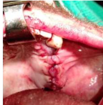
Fig. (6). Wound closure using the simple interrupted suturing technique.

graft material. The membrane was removed 4 weeks after the surgery. A CBCT scan was taken 6 months postoperatively to evaluate the bone height gained. The preoperative and 9-month postoperative mean height was (3.1) mm and (9.6) mm, respectively. The alveolar width gain was (6.5) mm (Fig. 8).