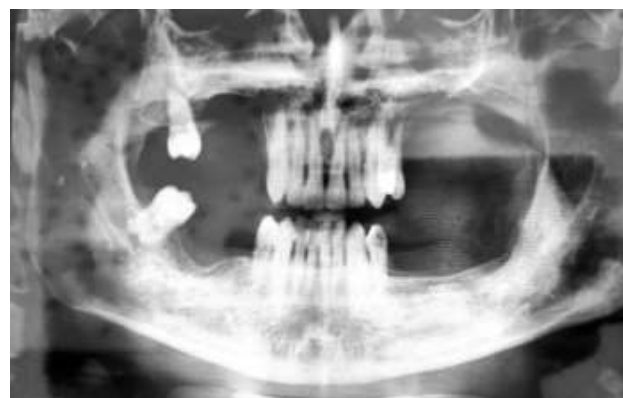
Fig. (2). Preoperative OPG showed a large vertical defect in the left posterior region of the maxilla.

Under general anesthesia, a full-thickness flap mucoperiosteal was raised using two vertical incisions and one crestal incision. Additionally, the palatal flap was also elevated to fully expose the alveolar ridge. Several perforations were made at the buccal and crestal sides of the recipient bone using a small round. The iliac bone harvesting procedure commenced with an incision made on the skin, located 1.5 cm posterior to the anterosuperior iliac spine (Fig. 2). The 3-4 cm incision ran parallel to the iliac crest, with the aim of preventing damage to the lateral femoral cutaneous nerve. The exposure of the iliac crest proceeded with the elevating of the periosteum. The harvesting site was delineated with a one-mm diameter drill, a series of holes were created, and the cutting was finalized using a rotating disc (Fig. 3). An ample amount of the cancellous bone was harvested using a curette. A hemostatic sponge (Gelfoam, Pfizer, USA) was inserted into the harvested site, and the wound was sutured closed in two layers; the periosteal layer was sutured with vicryl 4/0 (SURGIReal, USA), and the skin was closed with 5/0 nylon (SURGIReal, USA).