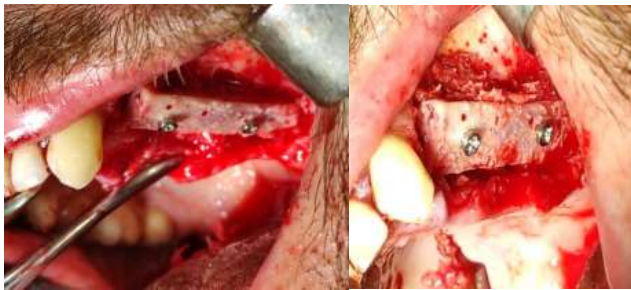
Fig. (4). Fixation of the bone block using two tenting screws.

The recipient site preparation, graft shaping, and membrane fixation were carried out utilizing a special kit (InnoGenic™ GBR Kit, Cowell Co, South Korea). The harvested thick block was contoured to fit in the recipient site. The bone block was secured in place using two tenting screws (Tenting screw, Cowell Co, South Korea). The spaces formed between the bone block and the host bone were filled using a particulate cancellous bone graft harvested from the iliac crest (Fig. 4). The d-PTFE membrane (Teflon Sheet, Cowell Co, South Korea) was secured to the tenting screws using tenting cap screws (Tenting cap, Cowell Co, South Korea) (Fig. 5). The vertical incisions were extended apically, the periosteum was scored, and the flap was mobilized to permit a tension-free primary closure, which was closed with 4/0 nylon (SURGIReal, USA) (Fig. 6). Patients were prescribed amoxicillin/clavulanate 875/125 mg (Augmentin 1000, Maatouk Pharma, Syria) twice daily for 5 days, potassium diclofenac 50 mg (Flam K, Asia Co, Syria) as required, and antimicrobial mouthwash (Fresh Mouth, BIOGHAR, Syria) for 7 days.