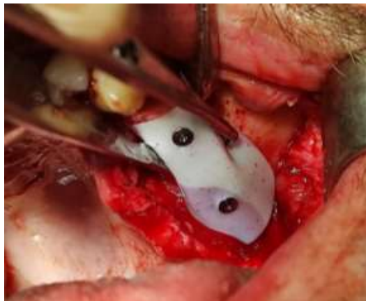
Fig. (5). Securing the dPTFE membrane to the bone block using two cap screws.

Although the membrane exposure was anticipated, it was less extensive than expected and occurred after 2 weeks (Fig. 7). The authors only cleaned the exposed area with a saline solution. The patient was recommended to rinse with a saline solution daily and maintain oral care. The Healing process was uneventful, with no significant complications. There were no infections or loss of bone