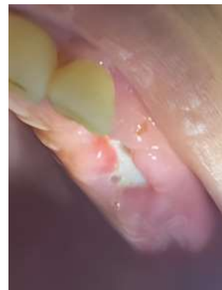
Fig. (7). Exposure of the dPTFE membrane to the oral cavity after 2 weeks.