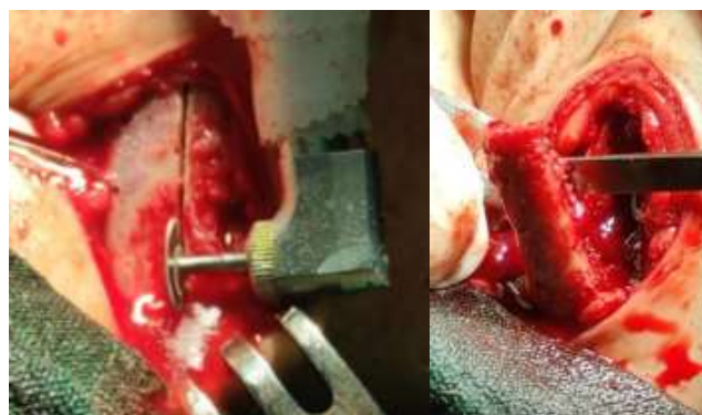
Fig. (3). Harvesting of the bone block from the iliac crest.